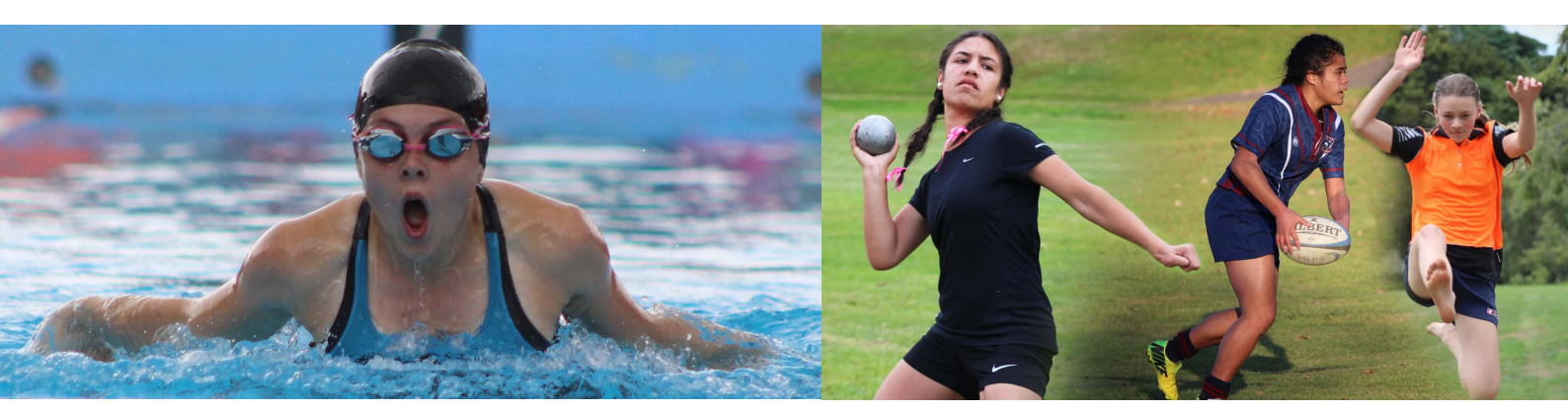
Sport and Outdoor education is considered an essential component for the development of all girls. There are many opportunities for students to broaden and enhance their education through sport and regular local and international field trips.

RGHS continues to produce and foster athletes who represent at Regional and National levels with a few reaching International fame. We have teams and individuals who are at the top of their chosen sport.