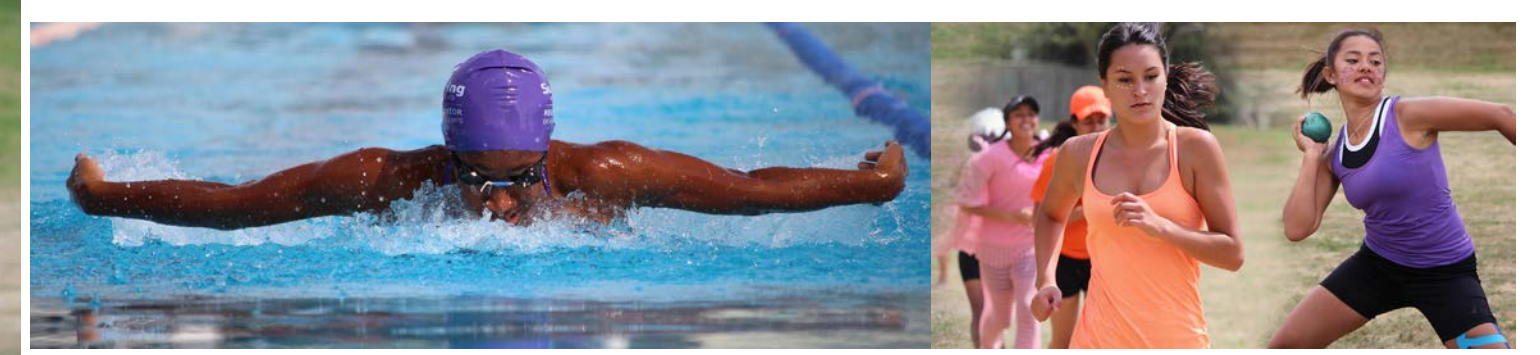
Sport and Outdoor education is considered an essential component for the development of all girls. There are many opportunities for students to broaden and enhance their education through sport and regular local and international field trips.

RGHS continues to produce and foster athletes who represent at Regional and National level with a few reaching international status.