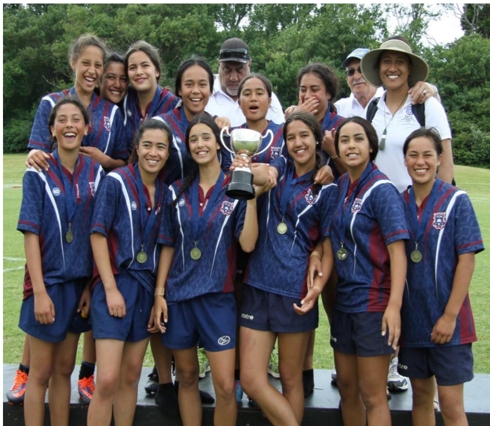
National Condor 7's U15 Champs - Rotorua Girls High School

This was Rotorua Girls High School’s first year in the tournament after finishing 2nd in the Bay of Plenty Secondary Schools qualifying tournament behind Tauranga Girls College who Aorere College dismissed in the semi-finals.