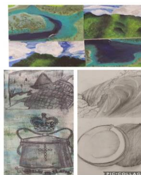
Kimalyn Smith Level 2