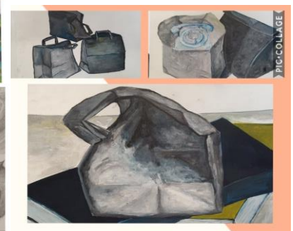
Anahera Green Level 2