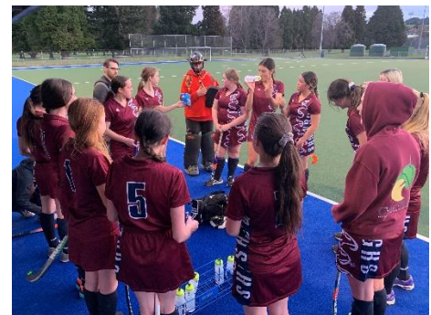
(RGHS 1 st XI Hockey in June)